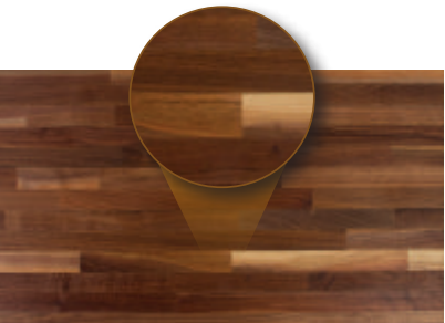
American Black Walnut