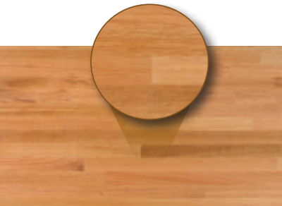
Appalachian Red Oak