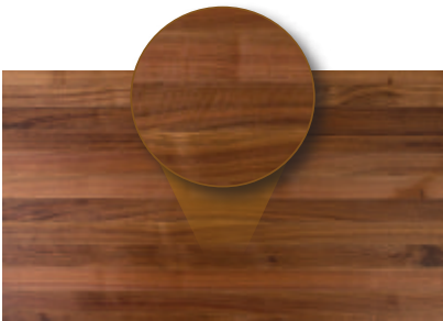
American Black Walnut (Standard 2-3 finger joint per interior rail on 8' or longer Walnut KCT.)