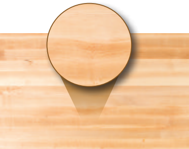
Northern Hard Rock Maple

The Boos® Extra 1" Edge: All Boos® counter tops in standard lengths of 8' or longer are manufactured with 1" added to the length. This is another exclusive Boos® bonus offering for fabricating a long block into two shorter blocks, allowing room for the saw cut, yet maintaining the full length of both block requirements.