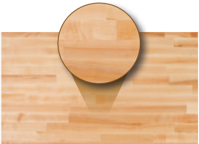
Northern Hard Rock Maple