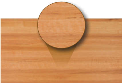
Appalachian Red Oak